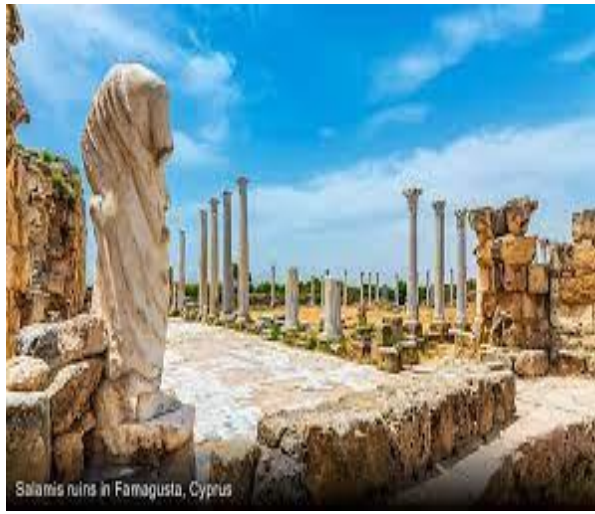
Salamis ruins in Famagusta, Cyprus