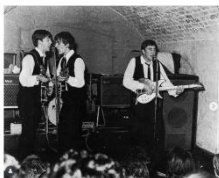
Beatles at the Cavern Club

First record was with Tony Sheridan (established singer) My Bonnie lies over the Ocean by Tony Sheridan and the Beat Brothers. Saddened by news that Stuart Sutcliffe died of brain haemorrhage. (1)