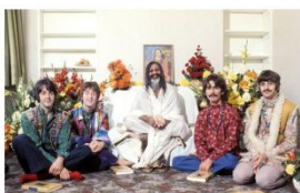
Maharishi and The Beatles

Back to 1967 Beatles could do nothing wrong musically. All you need is love was for a satellite broadcast to 400 million people in 25 countries. Recorded Sgt Pepper's Lonely Hearts Club Band, best selling maybe best record, With Little help from my friends, Lucy in the Sky with Diamonds, When I'm 64, Day in the Life. (10.5)