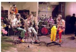
Beatles - All you need is Love

Next film was Yellow Submarine, a psychedelic cartoon.' I remember queuing to watch it at the Essoldo on Nottingham Road. Did my best to like it. Not a great film, simplistic story about the blue meanies who don't like music, Beatles go in yellow submarine to rescue Pepperland'. (10)