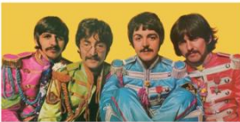
Sgt Pepper's Lonely Hearts Club Band

Television film 'Magical Mystery Tour'. Seemed to be LSD drug influenced. When completed nobody liked it, even those who made it, released and everybody hated it. After it was shown on Boxing Day 1967, critics agreed that it was awful. Some good songs but terrible film.