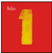
The Beatles (1, 2000)

Last photo of the group before break up, in Aug 1969. 15