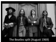
The Beatles split (August 1969)

Fifth film 'Let it Be' most interesting as the Beatles are writing songs for Let it Be album. Really good music and songs. Released in May 1970 soon after Beatles break up.