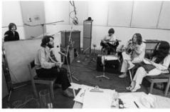
The Beatles (and Yoko)

During the recording of the White Album in 1968, cracks started to appear in the group. Ringo was getting bored and quit but was persuaded to return. My favourite album, but would have been better if it was a single LP instead of double, includes Back in the USSR, Glass Onion, While my guitar gently weeps, Blackbird, Julia, I will, Helter Skelter, some of McCartney's worst