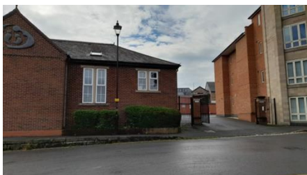
Access to the car park from Darley Lane

Free parking is available at the Church Hall, accessed via Darley Lane. There is usually plenty of space, but Church activities (eg funeral, special mass) may mean it is full. In this case, you should be able to find parking spaces in surrounding streets.