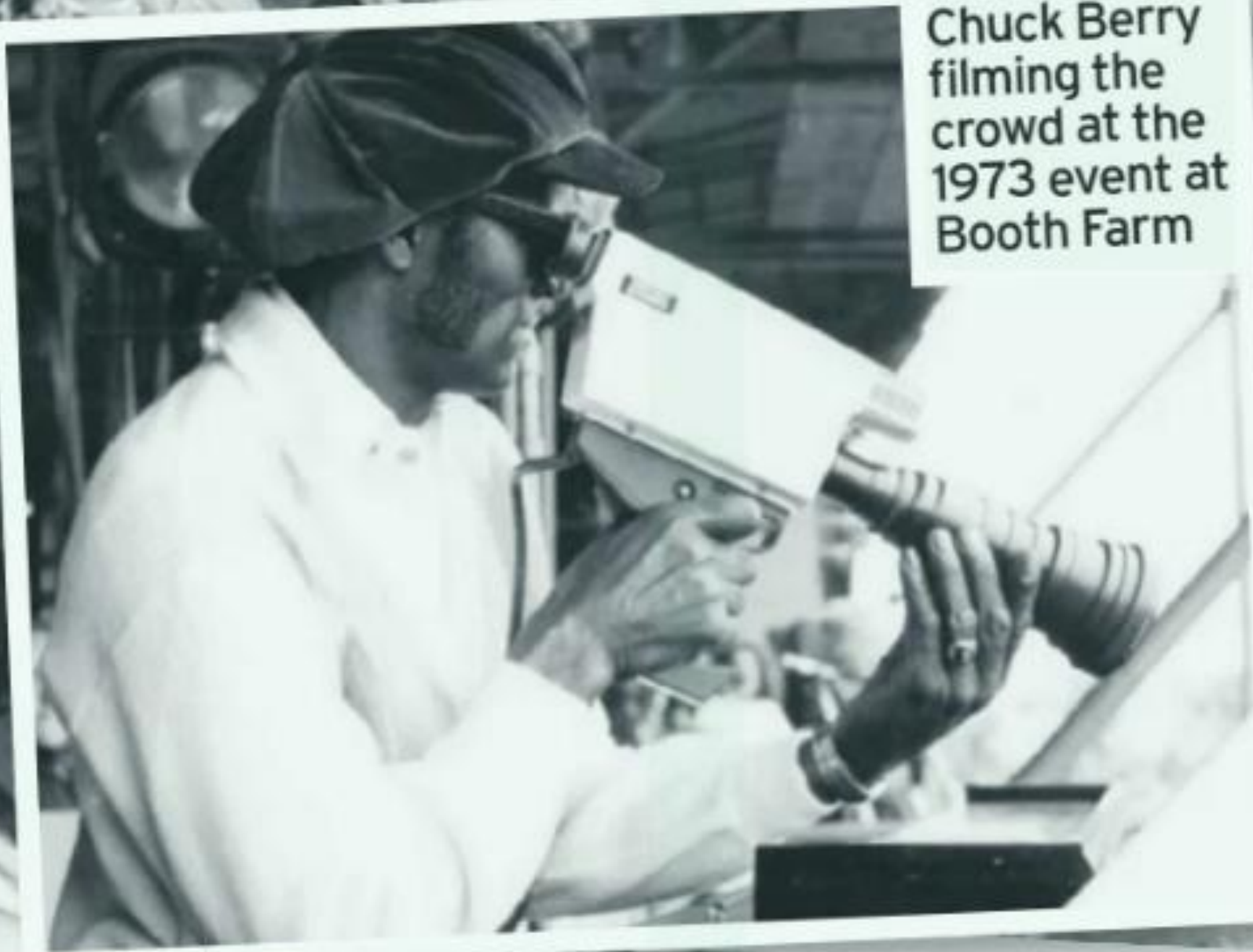
Chuck Berry filming the crowd at the 1973 event at Booth Farm