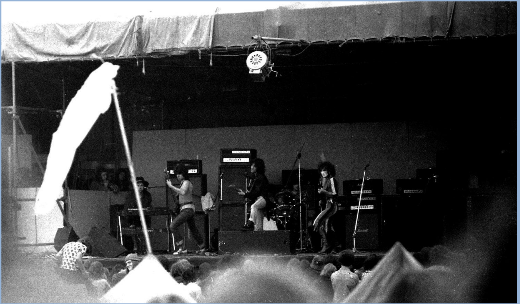
Sensational Alex Harvey Band