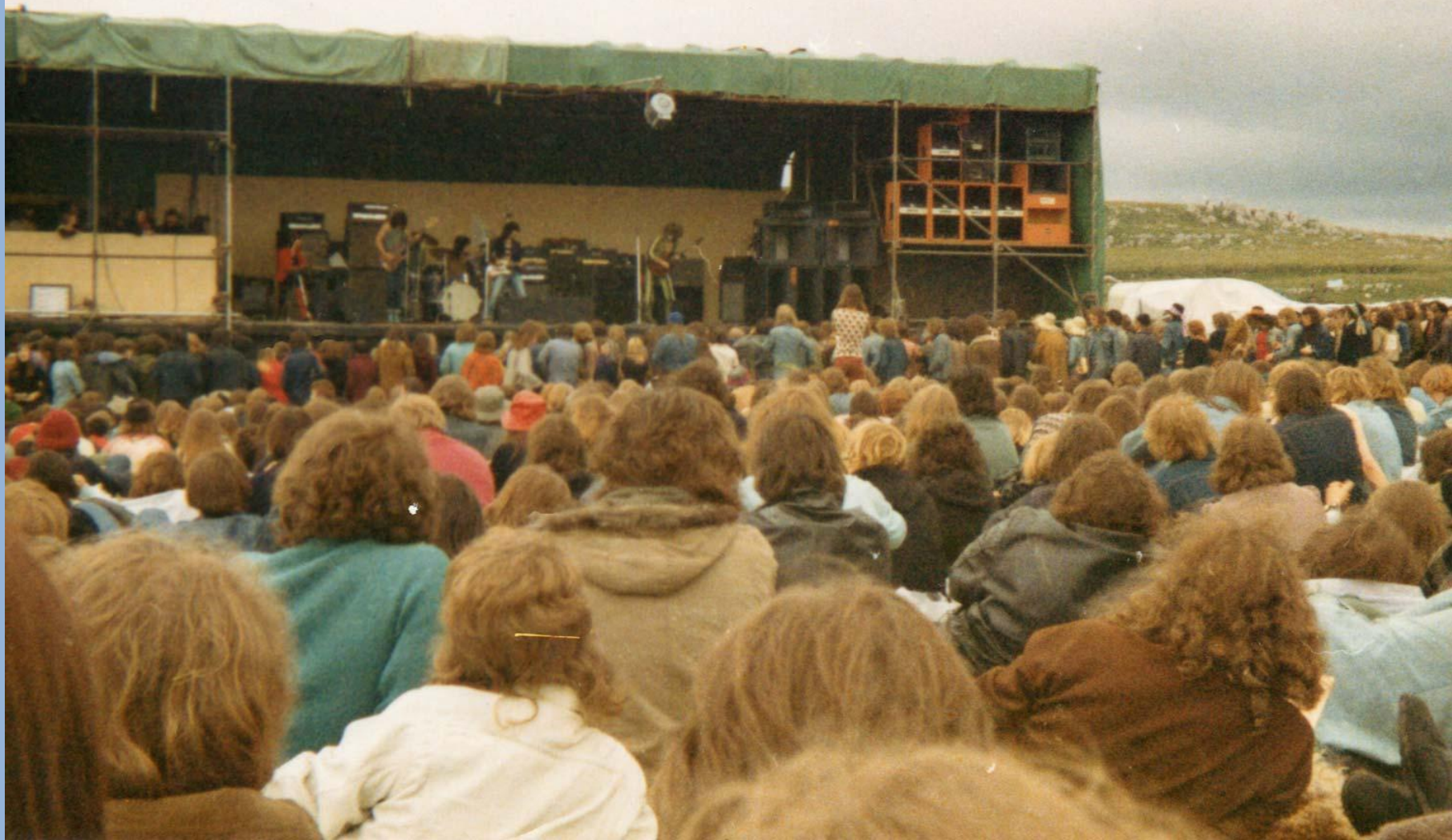
Sensational Alex Harvey Band